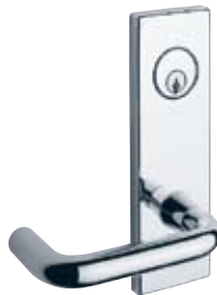
Schlage levers and locks