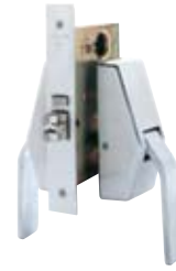
Glynn-Johnson push/pull levers