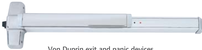
Von Duprin exit and panic devices