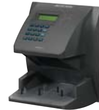
Schlage biometric readers